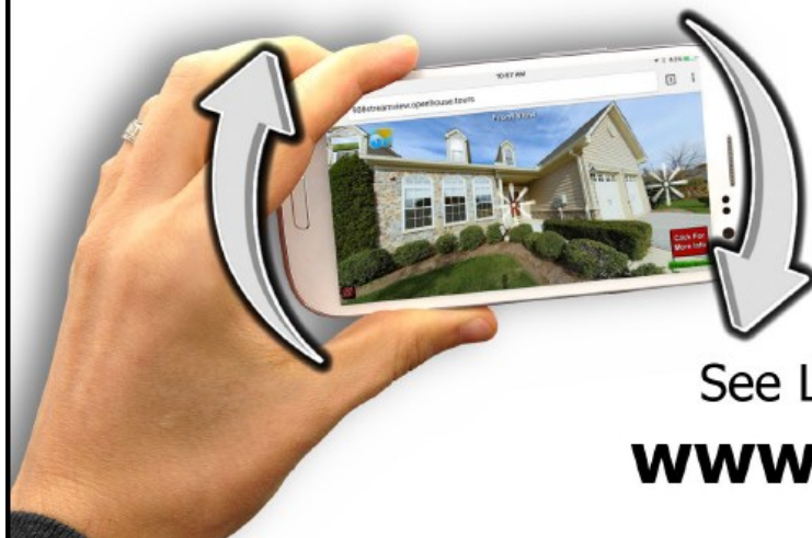
Photo packages starting at $100 True VR Tours that will amaze! Ground-breaking VR Videos! Fast turn-around times! Brand-Free for MLS

See Live Local Demonstrations! www.OpenHouse.tours