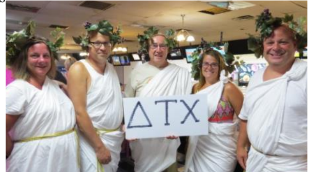
See more photos on RAYAC's Facebook page .